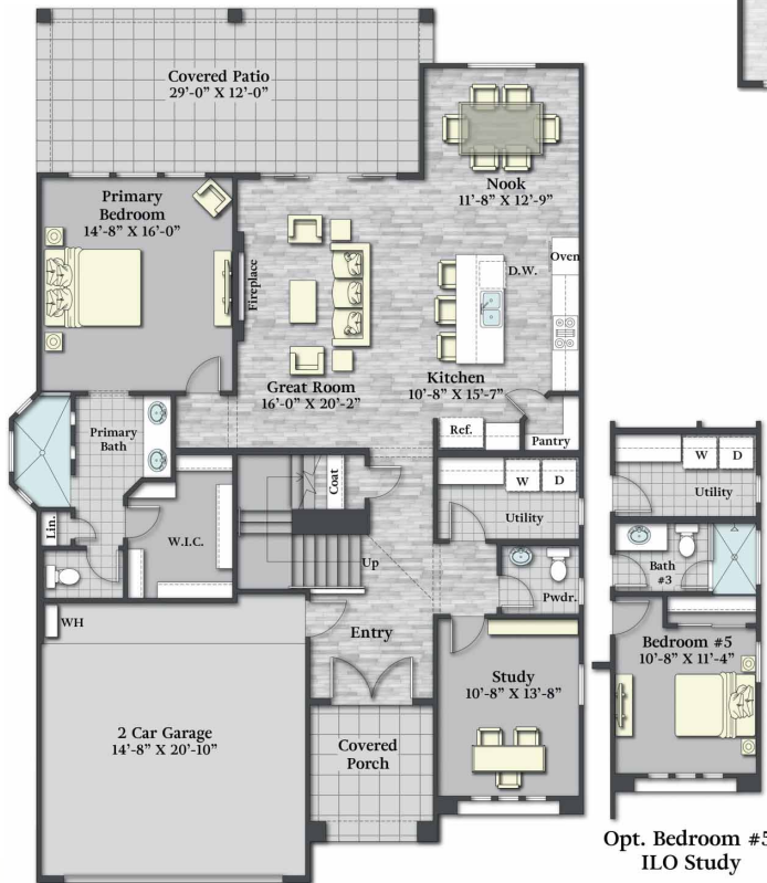
Opt. Bedroom #5 ILO Study